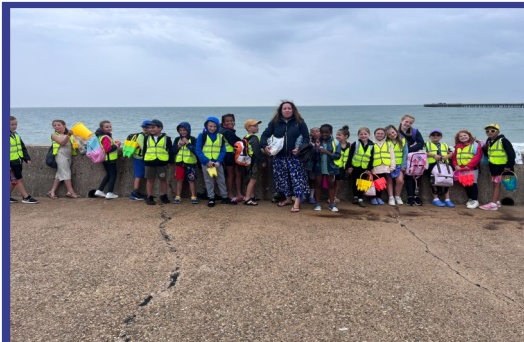
India class having fun in Walton On Naze